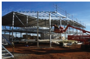
Laverton, Gold Mine, WA Australia Supply and construction of a Mine Worker Accommodation. This project saw an extension to Barrick Golds existing accommodation village, increasing the site capacity by 144 en suite rooms. Believe it or not but we were building one of these buildings every 30 days.