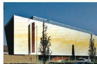
Light Box Building, Woking UK The Architecturally inspired building, offers a unique exterior finish of tarnished Aluminum and weathered timber. The Light box is a designated exhibition, art and educational building commissioned by the local authority of Woking UK.