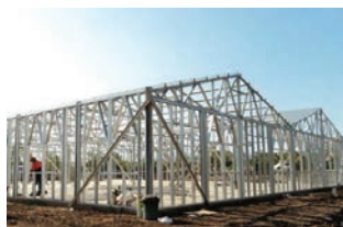
Nebo Mining Camp and Mess Hall, QLD Australia Designed for purpose we installed these accommodation and mess hall buildings at a private mining camp in Nebo near Mackay QLD