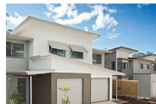
Mort St, Toowoomba, QLD Australia An ideally located development situated just 5 minutes from Toowoomba CBD. This project comprises of 4 Townhouses each with 4 bedrooms and 2 bathrooms. The homes will set the benchmark in Toowoomba for town house design. Spacious and well presented set among a mature area of the city, residents of these homes will benefit from great schools, shops and Toowoomba's famous parks within walking distance, they will also enjoy the strong growth of the greater Surat Basin region with easy access to other parts of South and South East Queensland the city is expected to grow from 150,000 to 250,000 over the next 15 years making it Australia's 2 biggest inland city next to Canberra.