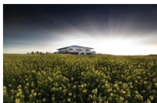
Bagots Well, Mid-North SA, Australia Remote 4 bed home, built in a traditional design and completed in under 16 weeks.