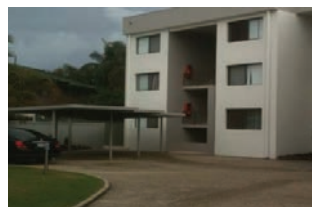
Huth st, Labradore, QLD Australia This renovation development consisted of 12 units, all 2 bedrooms and in very poor condition. The building had an interesting past having been a hostel then serviced apartments then rentals.